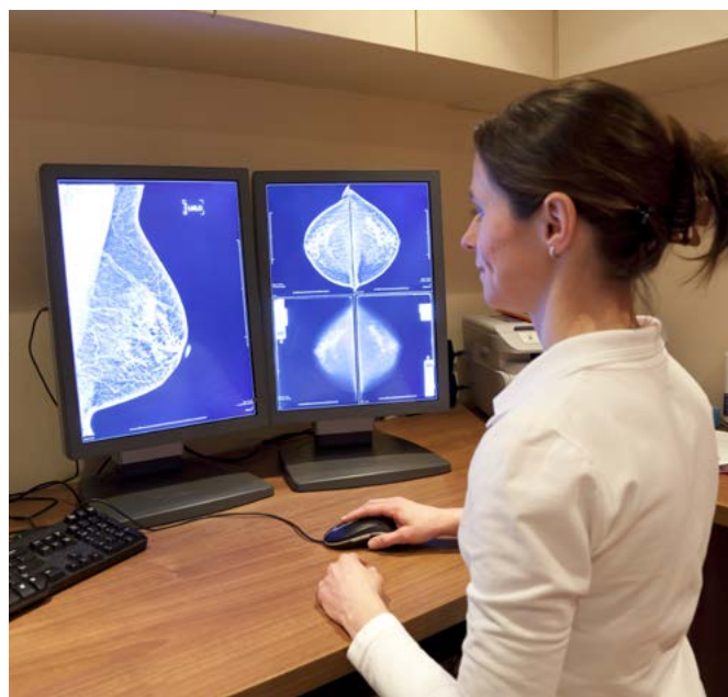
Free mammograms will soon be available for women aged 70 to 74 – you've helped to make this a reality.

If you are in this age group, we want you to be aware that you are still at risk of breast cancer, so it's vitally important you regularly check your breasts and see a GP promptly about any unusual changes.