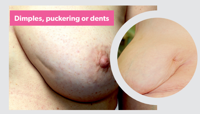
Dimples, puckering or dents which can appear anywhere, even on the underside of the breast.